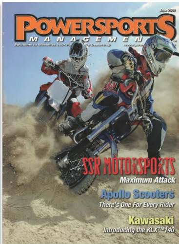
Powersports Mgmt. - June 2008 Company Focus