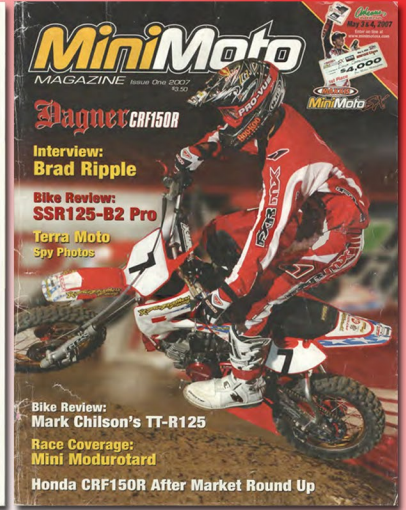
MiniMoto - Issue One 2007 SR125-B2 Pro