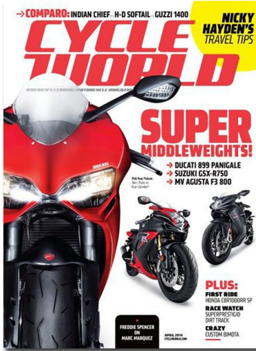
Cycle World - April 2014 SR250S