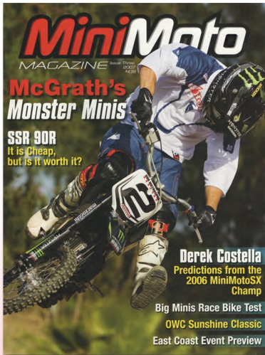
MiniMoto - Issue Three 2007 SR90R