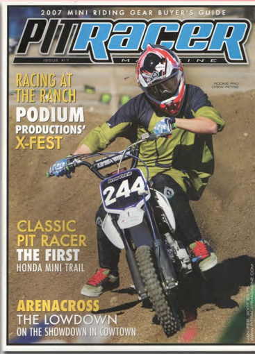
Pit Racer - Jan / Feb 2007 LBC Show