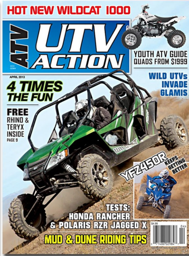
ATV UTV Action - August 2013 SR500-LT