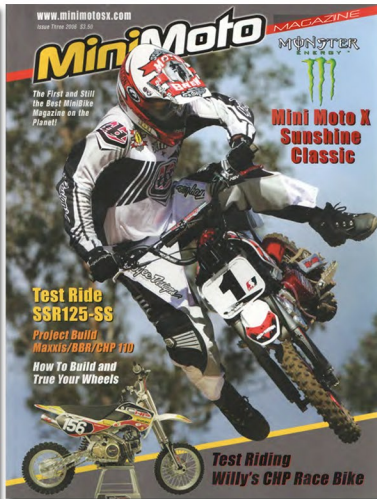
MiniMoto - Issue Three 2006 SR125SS