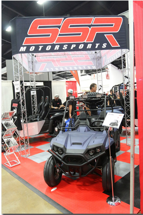
Sand Sports Super Show

SSR Motorsports displays at many of the industry trade shows and events each year to help increase brand awareness.